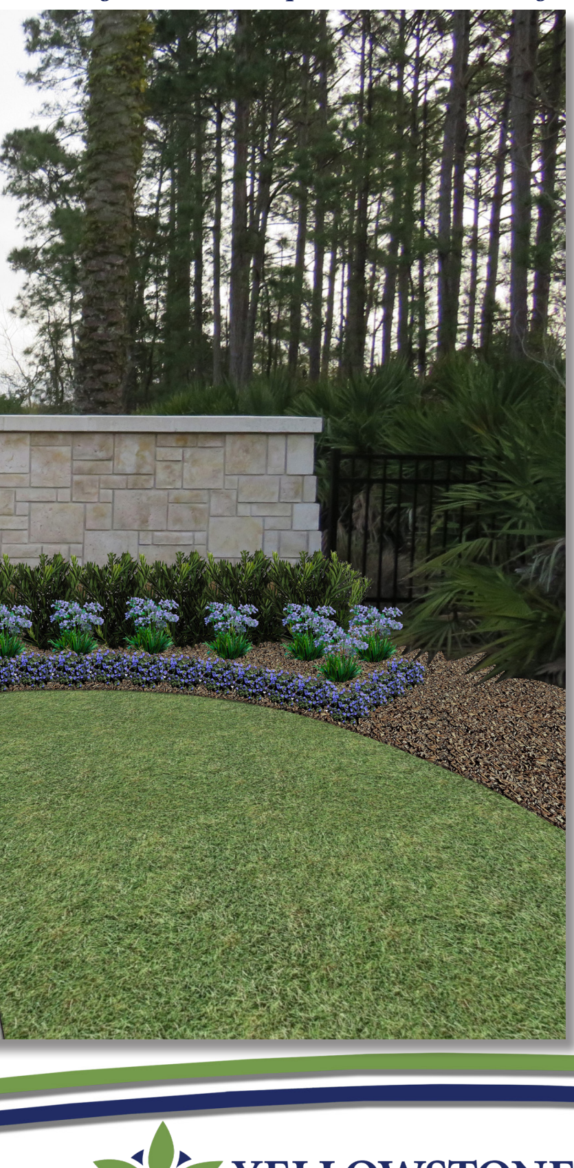
Conceptual Rendering-Plants are depicted at mature stage